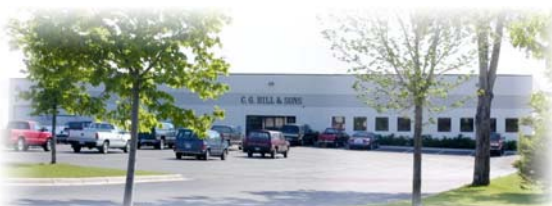
Modern Facility - Large Shipping Dock - Located on Major Freeway

Designing, Building, Repairing of Machinery & Equipment